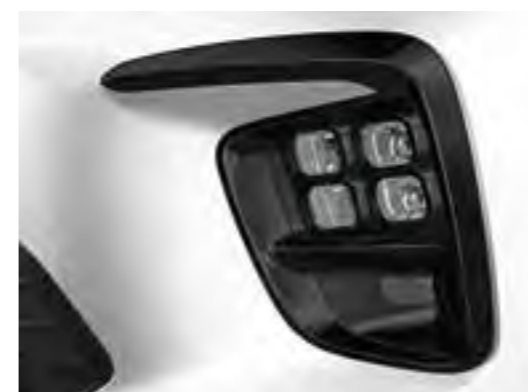
GT Line ice-cube fog lamps The striking ice-cube design transforms the LED fog lamps into high-tech must-haves.

From the muscular front bumper with integrated ice-cube LED fog lamps, stunning contoured radiator grille and LED headlamps, to the rear bumper with twin muffler – the Rio GT Line shouts style and adventure. Add to that exclusive 17" alloy wheels, side-sill styling and a sleek interior and you have a car that leaves others behind.