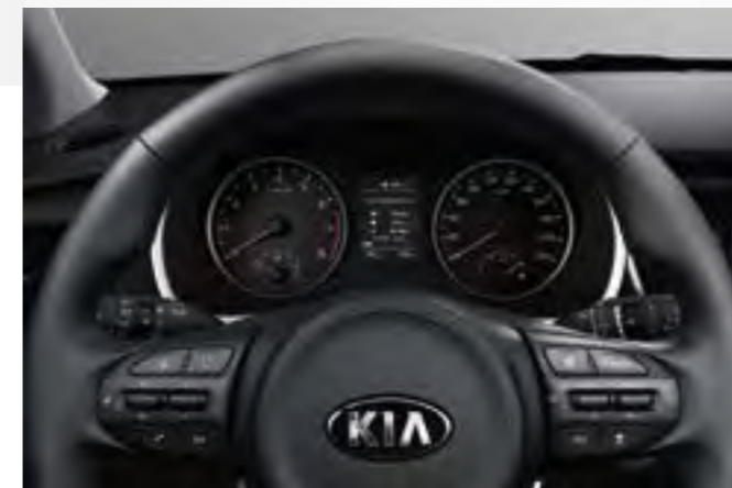
Supervision cluster with 4.2" LCD display A tasteful, customizable and intelligently designed supervision cluster displays outside temperature as well as vehicle and trip data, and lets you adjust the settings of your Rio.

Connectivity is woven into the very essence of the Kia Rio, with state-of-the-art technology and infotainment systems. Check out the 4.2" fully digital cluster display. Choose from the optional 8" touch screen navigation system, featuring the innovative UVO Connect telematics system, which includes 'Kia Live' services such as Live Traffic, Live Parking and Live Weather, as well as Smartphone-App-based services including Remote Door Lock and Door Unlock; or chill out with an optional 8" touch screen audio system that's compatible with Android Auto and Apple CarPlay. All in all you'll be spoiled for smart choices.