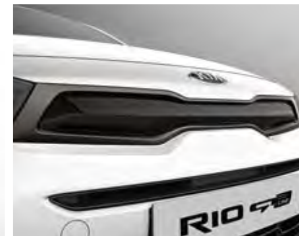
GT Line radiator grille A combination of high-gloss finish and dark chrome surround gives the GT Line grille that special sporty and bold statement.