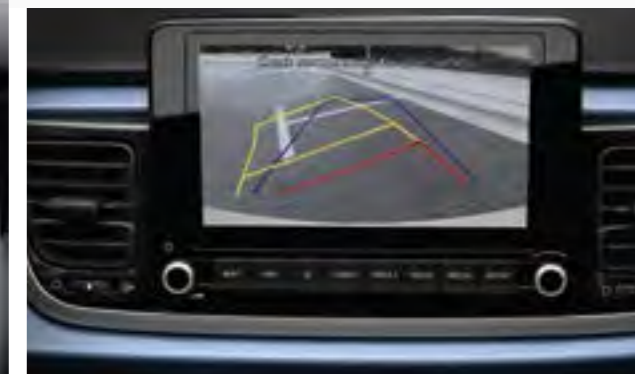
8" TFT-LCD colour screen navigation system The multi-language navigation system includes UVO Connect and a back-up camera display.